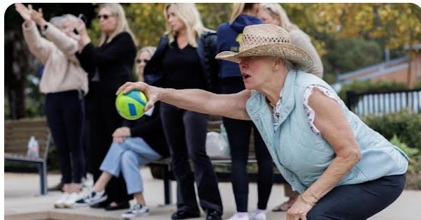
Move over, pickleball: In this wealthy L.A. neighborhood, another game reigns supreme